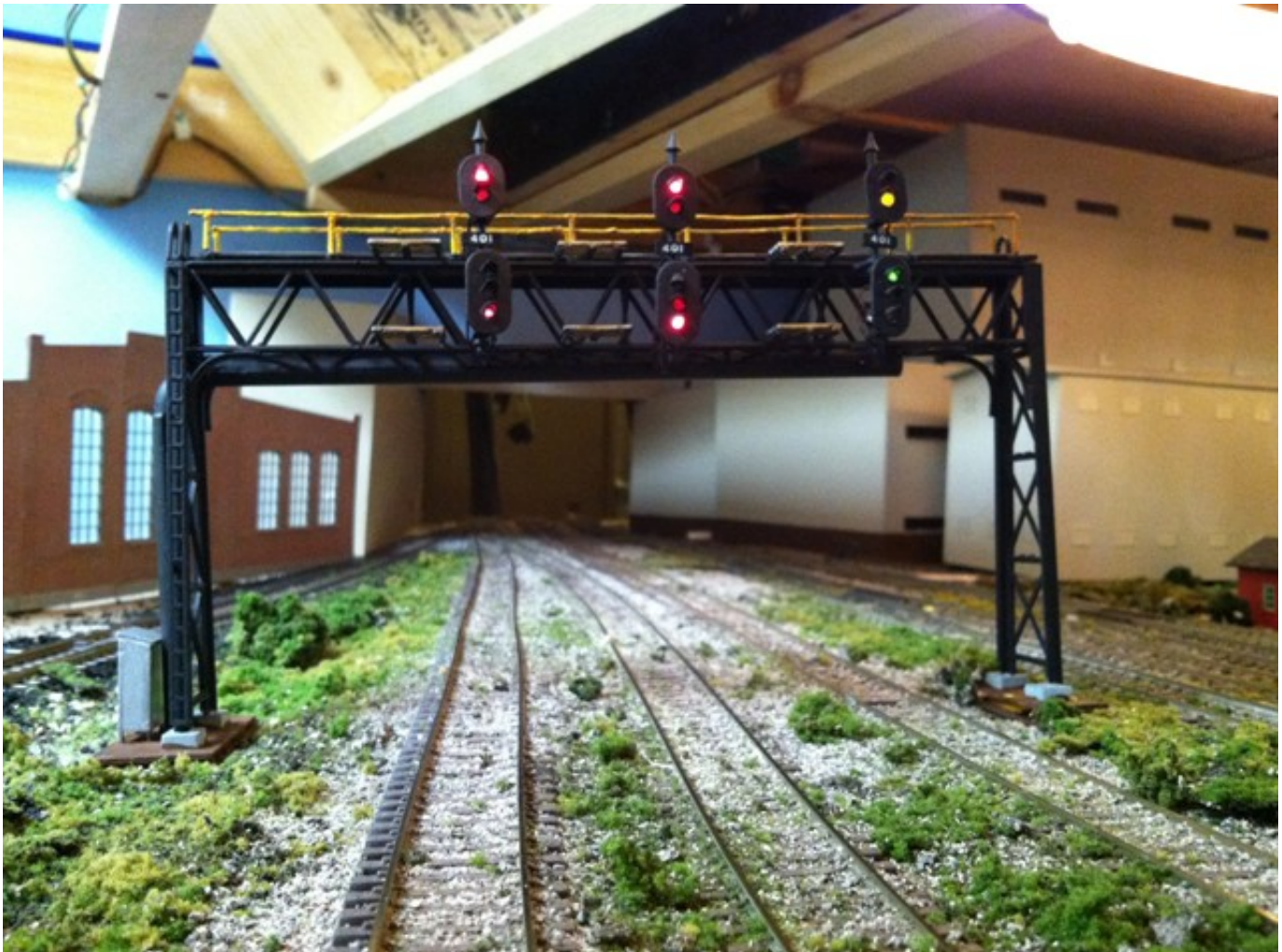
The new eastbound signal bridge in Nickel City went on line on June 30,

Work crews continued the signal installation project started in the first quarter of 2013. Work continued on signals between the town of Underwood through Nickel City. By December, most of the mainline signals had been installed. One of the more complex projects was the construction of the eastbound signal bridge over