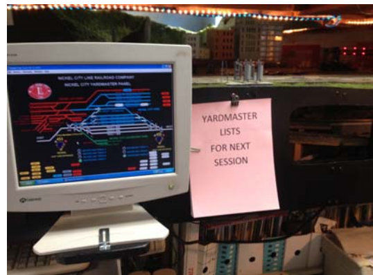
A new monitor location and clip for paperwork in the Yardmaster's Office.

Each area has throttle holders and plug ins. Yellow instruction placards provide each person with detailed instructions for the position. Scenery has been completed up to the newly painted fascia. The upper deck fascia has also been painted and