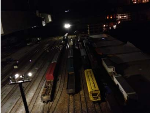
Light Towers at both ends of NC Yard.

low voltage lighting has been installed at the locomotive service racks, the Little Locomotive Maintenance Facility, the Nickel City passenger station, and two yard light towers in Nickel City Yard.