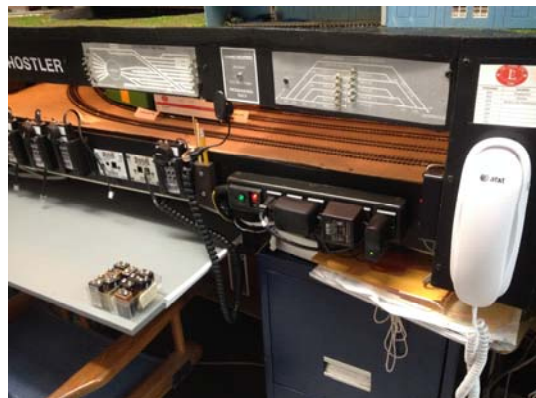
A new look for the Hostler Office.

While renovation work was on going in those offices, the Radio Shop installed several additional simplex radio transmitters along the mainline. These transmitters (UR-91s) eliminated some gaps in radio coverage. The equipment was quickly ordered upon hearing that the manufacturer (Digitrax) is no longer supporting simplex radio transmitters.