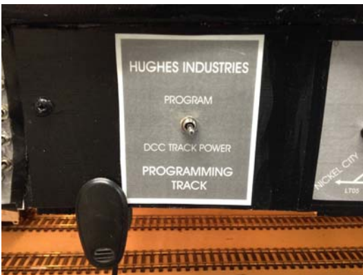
New control for Hughes Industries (Program Track).