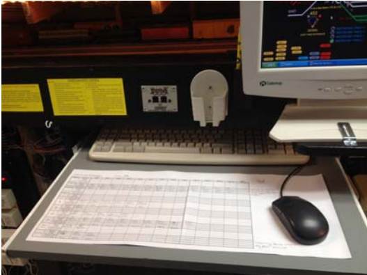
Freshly painted work surfaces complement the overall renovation.