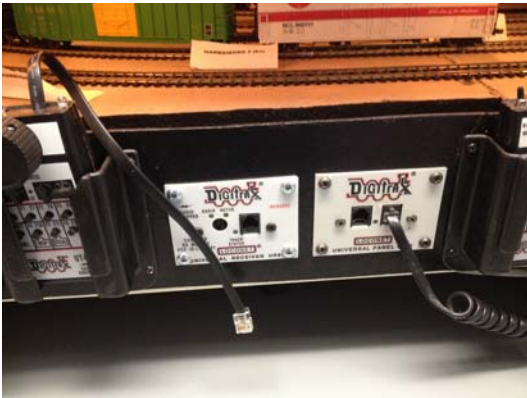
An additional UR91 plug in at the Hostler Office.