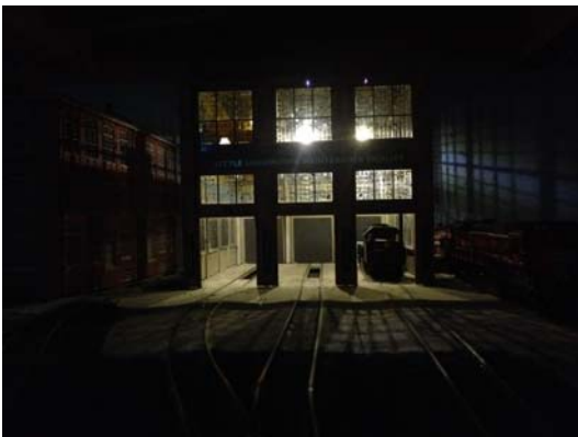
Brighter lighting in the Little Locomotive Facility.