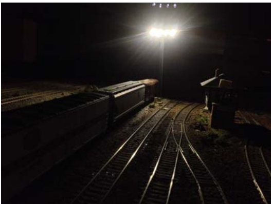
The new light tower at the east side of NC Yard.

Besides using less electricity, the new lighting is brighter and safer for our employees who work the night shift.