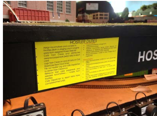
Detailed job instructions are posted for each work station.