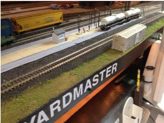
Scenery has been completed up to the edge of the finished fascia.

These improvements should make for a comfortable working environment for NCL employees.