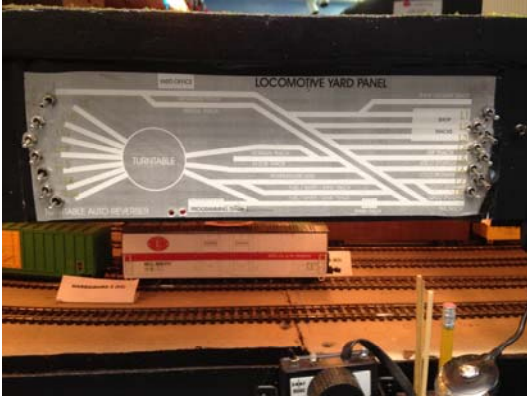
New control panel for NC Locomotive Yard.

Offices was complete. The renovations include the addition of a UR91 simplex radio transmitter which will help train crews in Ridgway Yard. The Hostler and Yardmaster have freshly painted new work areas and work surfaces.