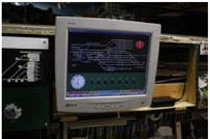
New Yardmaster computer screen.

The NCL Yard also received a computer upgrade. The manual yard panel was replaced with a flat screen and computer equipped with JMRI software. The Yardmaster now controls turnouts in the yard and consist locations on a computer screen instead of via magnets. This has increased the efficiency of yard operations and provided better tracking of cars when they are in the NCL