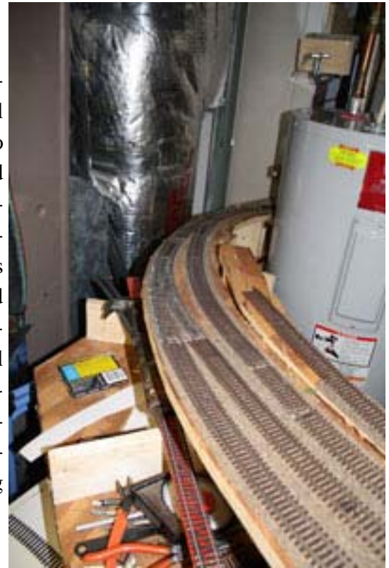
The new Harrisburg to Nickel City route.

First off, the main leg from Harrisburg to Nickel City was completely redesigned and rebuilt. Continuous problems with the original design necessitated the reworking of that area. The railroad had to be shut down for about 9 months while track work was reengineered and a new right-of-way was established. The relocation of the main-line created a more favorable grade for trains coming from or heading to Harrisburg from Nickel City. It also afforded local industries in Nickel City to claim land abandoned by the railroad on the old right-of-way. Several industries in Nickel City East were reconfigured to provide better service and delivery of railcars. The Nickel City Power and Light Company also expanded its structure to accommodate the increased demand for electricity. The redesign allows for local switching operations in Nickel City to be uninterrupted by mainline trains. This increased the efficiency of the morning industrial switcher run into Nickel City East.