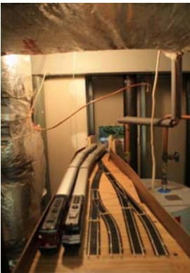
The new Western Line